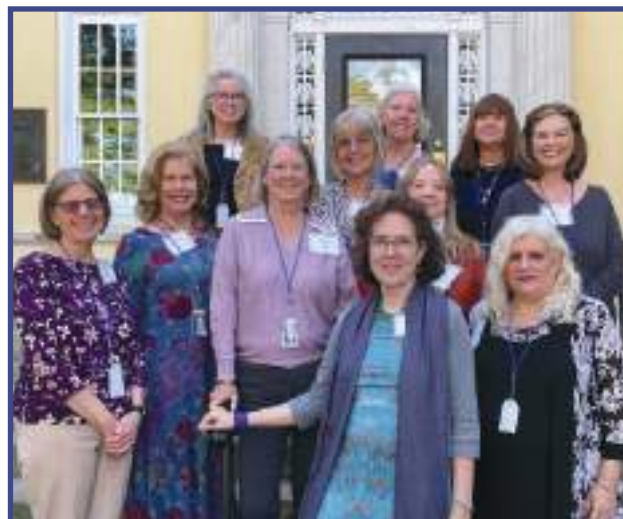
Members of the Class of 1972 celebrating their 50 year OLMA Reunion