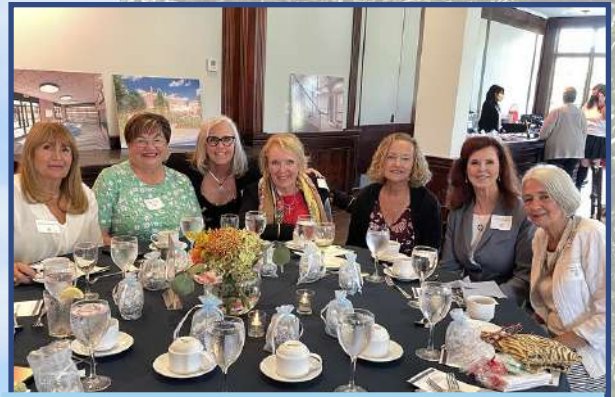
Members of the Class of 1971 returned to OLMA to celebrate their 50 year reunion.