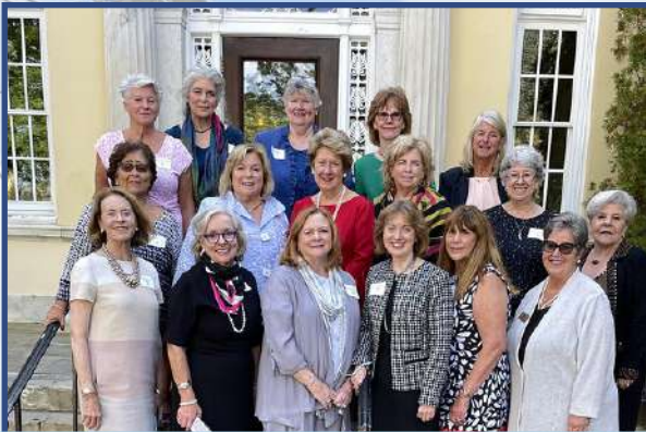
Members of the Class of 1970 celebrate 51 years since graduating OLMA.