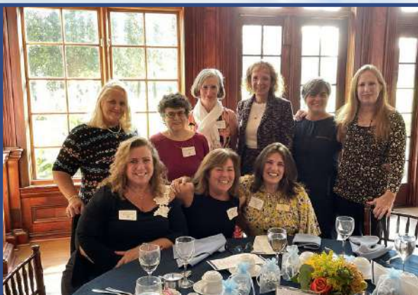
Members of the Class of 1981 celebrated 40 years since graduating the Academy.