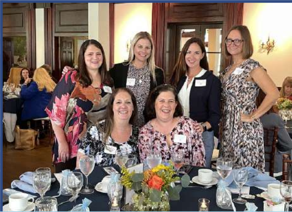
Members of the Class of 1997 returned to reminisce about their time at OLMA.