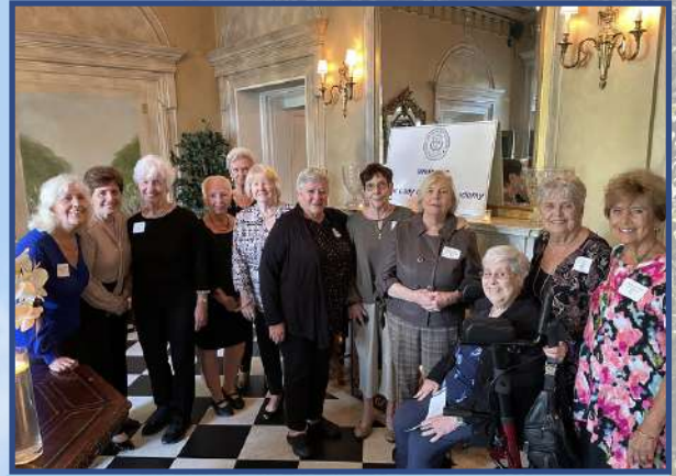
Members of the Class of 1960 returned to OLMA to celebrate their 60 year reunion.