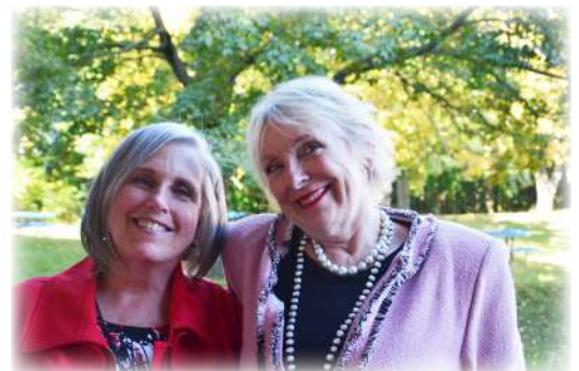
Class of 1971 at the Fall Combined Reunion Luncheon.