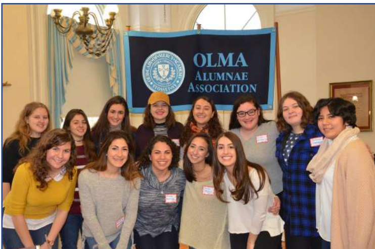
Pictured above are members of the classes of 2013, 2014, and 2015. Each January during Christmas break our college age students are invited back to OLMA for a Pizza Party and to reconnect with friends and faculty.