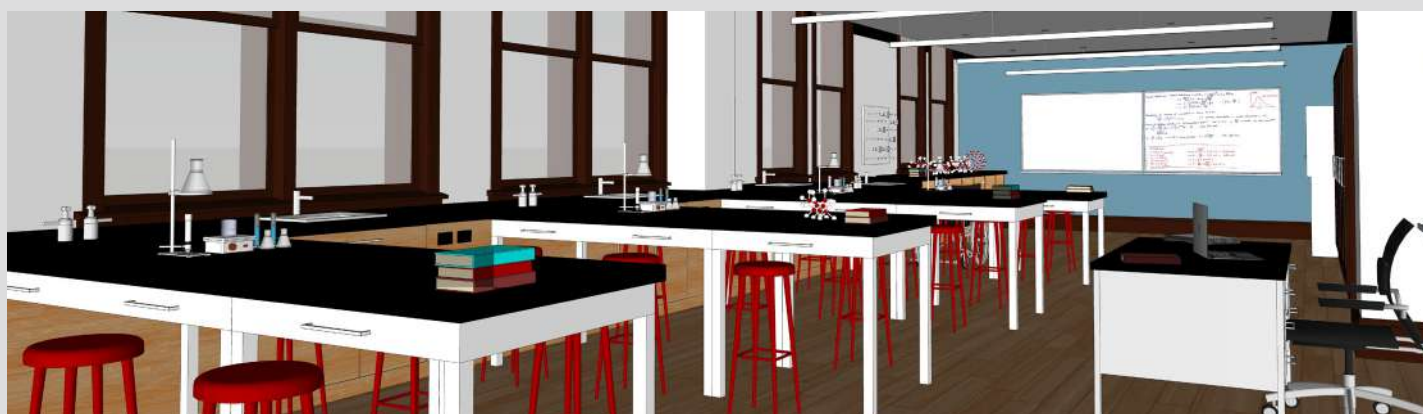
Conceptual rendering of the science labs. Coming Summer 2017!