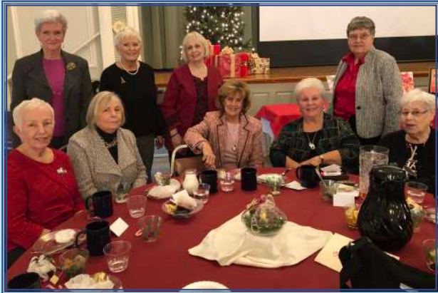
Members of OLMA Class of 1960 enjoying one another's company at the Christmas Tea.