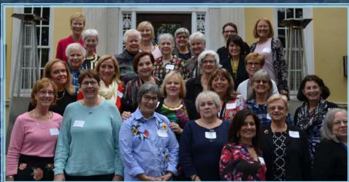
OLMA Class of 1968 celebrates 50 years

October's Mercy through the Decades Luncheon was the first time OLMA recognized former faculty members as honorees. They were selected based on input from the OLMA's Alumnae Association. Based on the feedback of alumnae, it was decided to open the nomination process up to all Mercy alumnae. The following is a description of the Award and how you can participate: