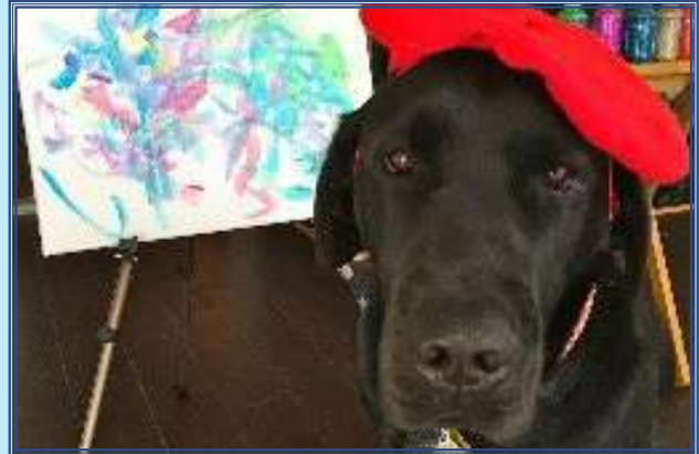
The star of the day, Dagger DogVinci.