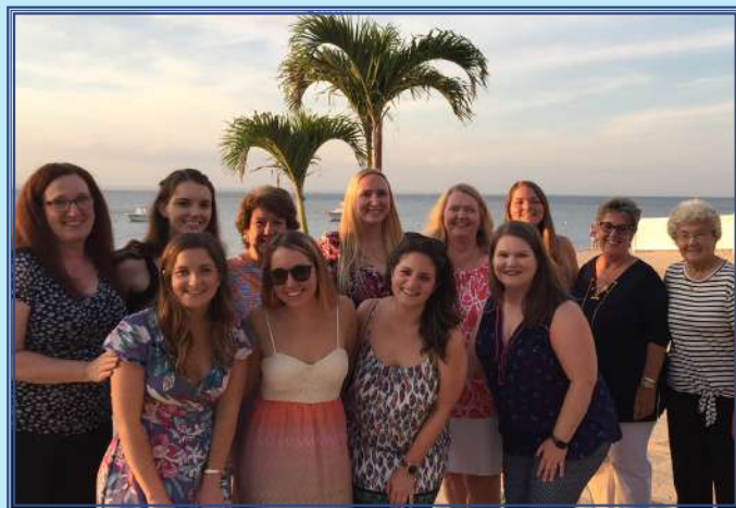
OLMA Alumnae supported the Kathy Stewart Memorial Scholarship event in August of 2018.