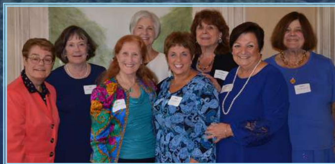
OLMA Class of 1964

All nominations must be received by May 1, 2019. A committee made up of members of the Alumnae Association will review all applications. The recipient will be announced in June and presented at the Mercy through the Decades event in October.