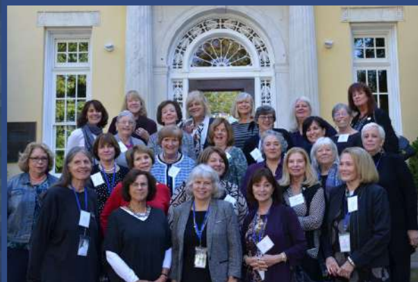
Congratulations to the Class of 1969 celebrating 50 years