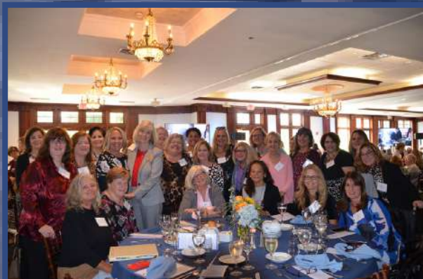
All years got together to catch up and celebrate