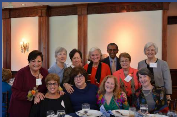
Congratulations to the Class of 1964 celebrating 55 years

Congratulations to all special reunion years!