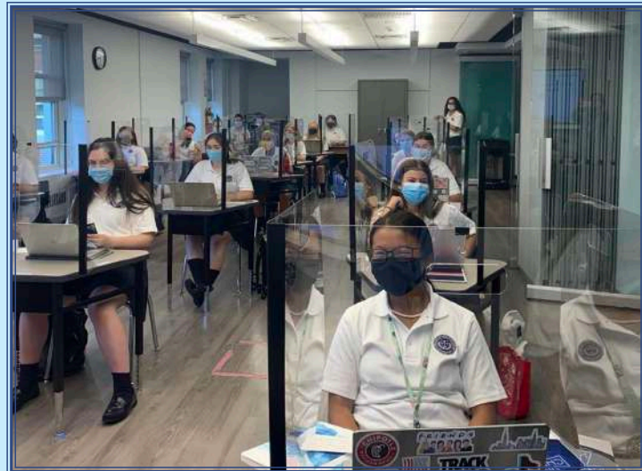
Polycarbonate dividers keep students safe.

At our Faculty and Staff Development Day, the administration shared with us a large area of focus for the 2020-2021 Academic Year. We are strengthening the three R’s: relationships, routines, and resilience. Through our relationships, we are learning to trust one another by practicing healthy habits of social distancing, hand washing, and face coverings. Adhering to routines helps us alleviate the uncertainties of the times we are experiencing. And finally, and most importantly, we are bolstering skills and mindsets useful to build up resilience in our Mercy family.