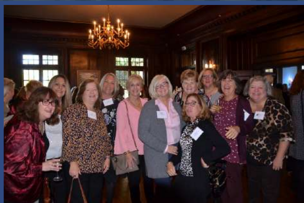
Members of the Class of 1979