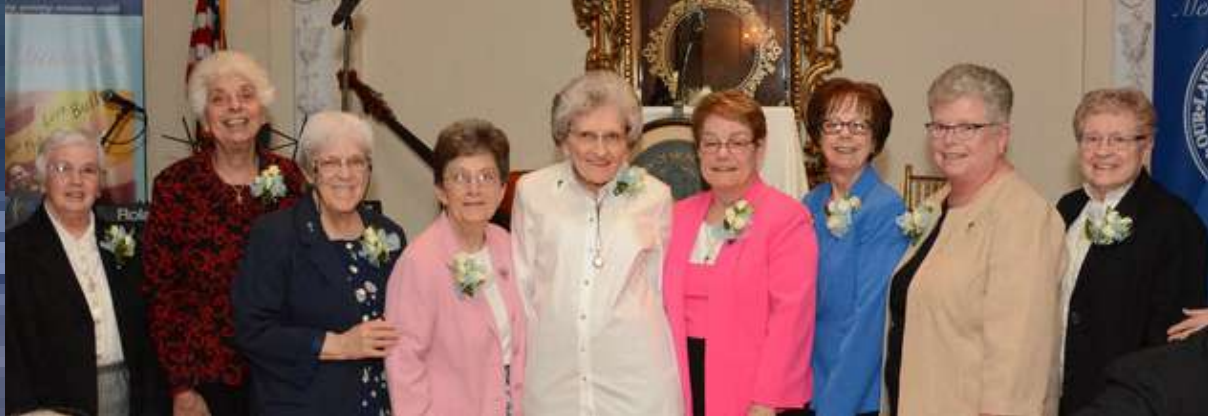
OLMA Alumnae Sisters of Mercy from left to right:

Just as the Sisters of Mercy envisioned and established Our Lady of Mercy Academy amidst the complex cultural challenges of the late 1920's and the devastating economic challenges of the depression era of the 1930's, each subsequent decade brought its' own set of challenges. And yet through this period, guided by the principles of Fides (Fidelity to Principle), Mores (Moral Integrity) and Cultura (Enrichment of Life), the mission and message of Our Lady of Mercy Academy has remained steadfast—preparing young women with a faith-filled education within a compassionate and nurturing environment so that they will engage in the world with a strength of purpose and values.